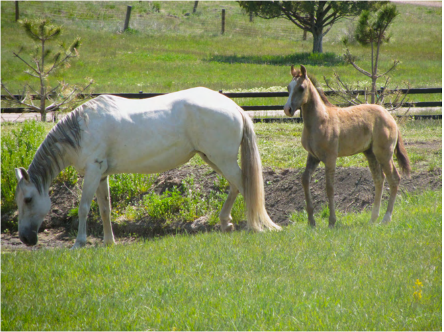
March 2013 Hallelujah do Summerwind - La Paz Jivago x Elba Cruzalta (sadly also deceased).