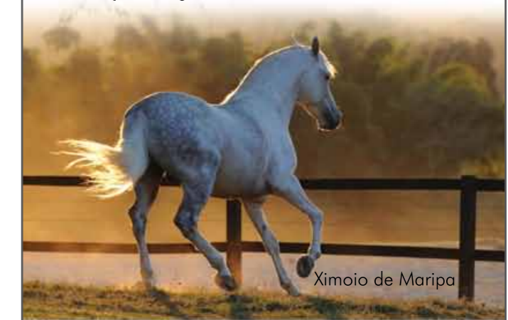
Ximoio de Maripa

info@summerwindmarchadors.com WWW.FUTUREFOAL.NET