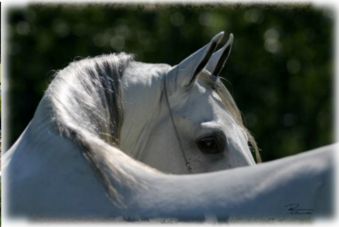
Senor do Porto - Brazilian Mangalarga Marchador