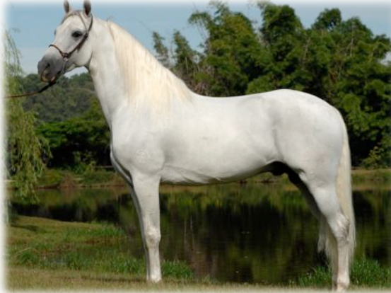
Ximoyo de Maripa, a young stallion of pure Abaiba blood. Oma de Maripa, a semen donor.